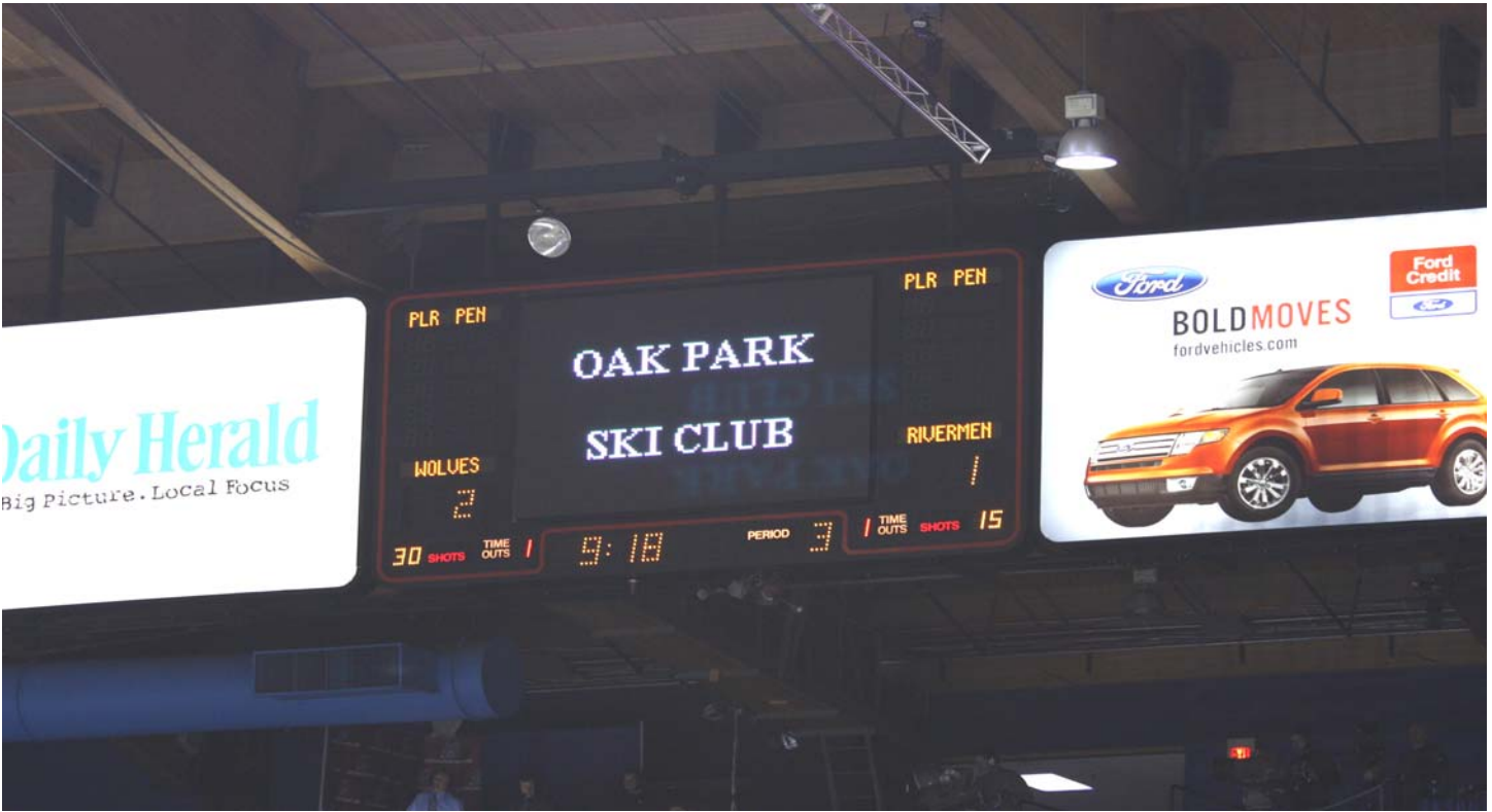
Oak Park Ski Club, Over All