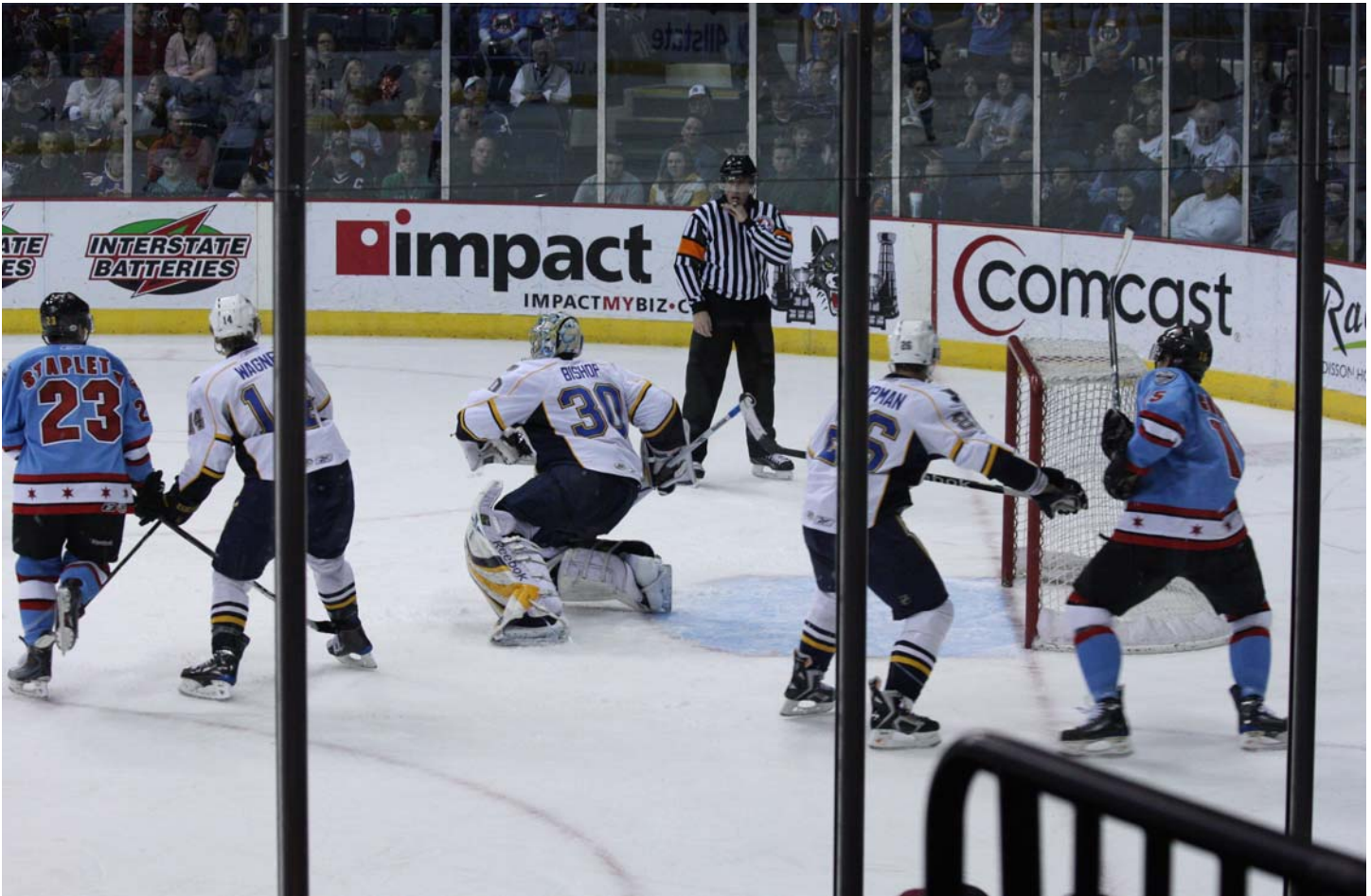
Rivermen Ready for next Assault, Rivermen Goalie.