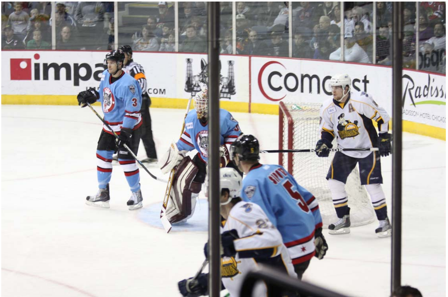
Wolves Ready for Next Assault, Wolves Goalie.

Yet another reason to belong to the Oak Park Ski Club. Be ready and steady to mark your calendars for another hockey outing next year.