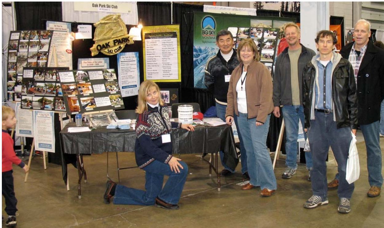
OPSC 2008 Ski Show Booth Rosemont IL

About this time of year we will be receiving visitors to our club at the general meetings, and so who will be there to meet them and greet them? Well, all of us, hopefully, but a cadre of greeters to meet these visitors officially would go a long way to an improved perception of the club. The greeters, volunteers all, would wear an identifying pin and help the visitors circulate. Please let us know if you’re interested in helping out as a greeter